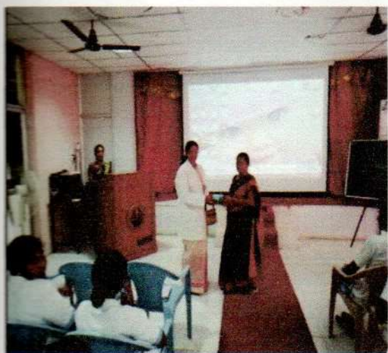
Behavioral Disorders among Children