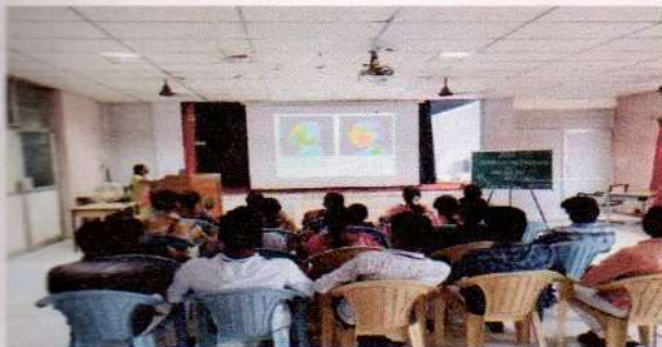
Effect of Technology on Children

Journal Club Meeting on 23.07.2018 and presented a journal article on "Toxic Synovitis" it is inflammation of the hip which cause limping and pain in the hip and leg, it is caused by viral infection.