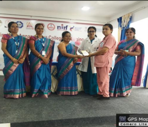
H3M6+Q96, Chinnasiragapadi, Tamil Nadu 636308, India Latitude 11.5849164° Longitude 78.0610175° Local 12:07:49 PM Altitude 11.05 meters GMT 06:37:49 AM Friday, 12.05.2023 Note : VMACON, Salem