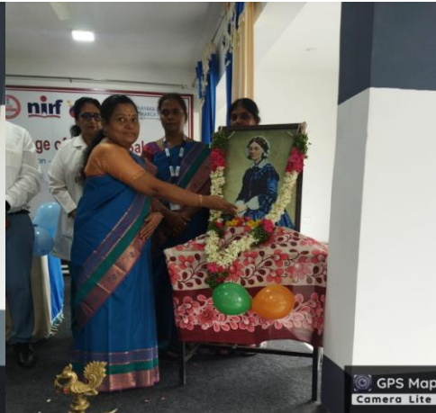
H3M6+Q96, Chinnasiragapadi, Tamil Nadu 636308, India Latitude 11.5849164° Longitude 78.0610175° Local 11:07:59 AM Altitude 11.05 meters GMT 05:37:59 AM Friday, 12.05.2023 Note : VMACON, Salem