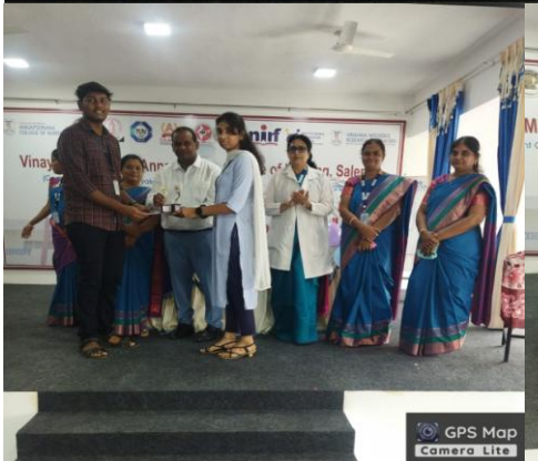
H3M6+Q96, Chinnasiragapadi, Tamil Nadu 636308, India Latitude 11.5849164° Longitude 78.0610175° Local 11:45:49 AM Altitude 11.05 meters GMT 06:15:49 AM Friday, 12.05.2023 Note : VMACON, Salem