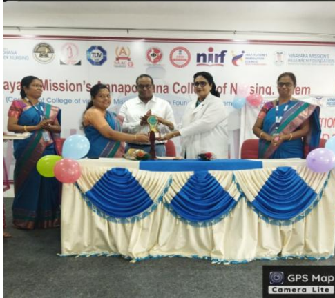
H3M6+Q96, Chinnasiragapadi, Tamil Nadu 636308, India Latitude 11.5849164° Longitude 78.0610175° Local 11:11:38 AM Altitude 11.05 meters GMT 05:41:38 AM Friday, 12.05.2023 Note : VMACON, Salem