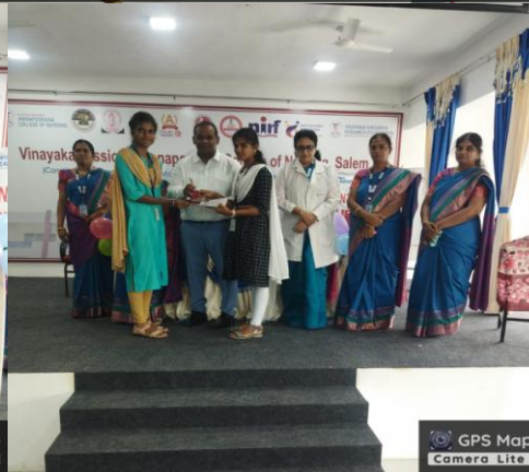
H3M6+Q96, Chinnasiragapadi, Tamil Nadu 636308, India Latitude 11.5849164° Longitude 78.0610175° Local 11:47:36 AM Altitude 11.05 meters GMT 06:17:36 AM Friday, 12.05.2023 Note : VMACON, Salem