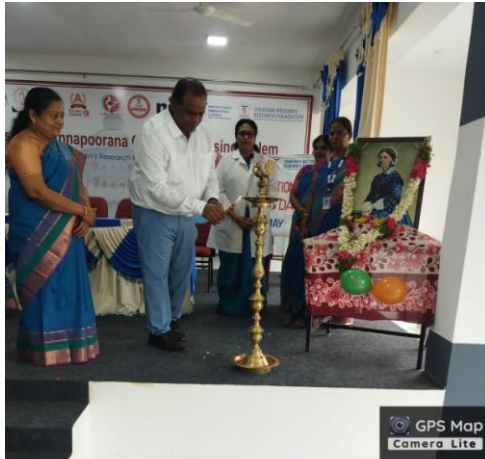
H3M6+Q96, Chinnasiragapadi, Tamil Nadu 636308, India Latitude 11.5849164° Longitude 78.0610175° Local 11:08:22 AM Altitude 11.05 meters GMT 05:38:22 AM Friday, 12.05.2023 Note : VMACON, Salem